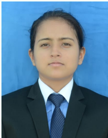
BABITA POKHRIYAL PARK PLAZA