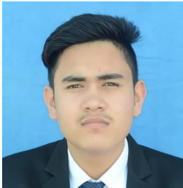
SURAJ BHORIYAL PARK PLAZA