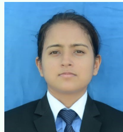
BABITA POKHRIYAL PARK PLAZA